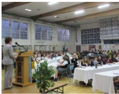
⑤ Young Women's Advocacy Summit