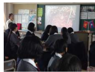
⑬ JICA Teachers' Program Report on Laos Visit