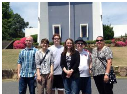
⑦ Students from Blair H.S., Nebraska