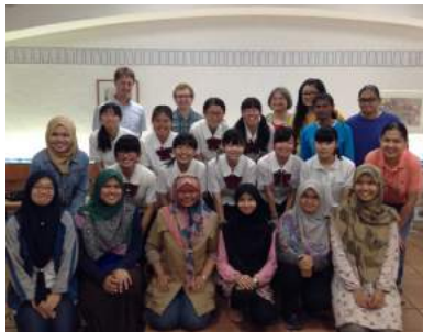
⑧ from Tun Husein On Malaysia University