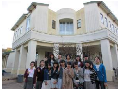
① Notre Dame San Jose H.S., California