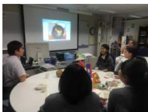
⑪ Global Cafe : Report on Korea, China, & Philippines Visits