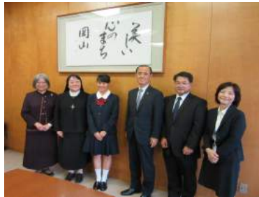
Courtesy Visit to Mayor of Okayama City