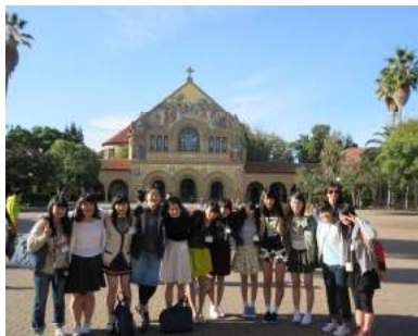
② Stanford University, California