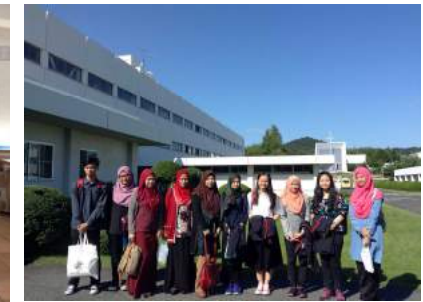
⑨ from Ibrahlim Girls' High School, Malaysia