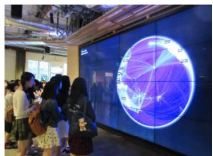
③ FACEBOOK, California