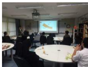
⑩ Global Cafe Report on Nepal Visit