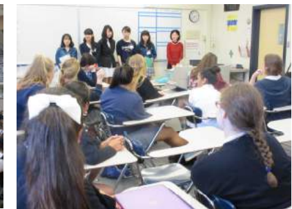
⑥ Presentation by Seishin Students