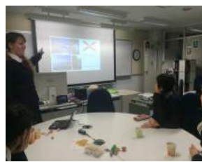
⑫ Global Cafe Jade, exchange student