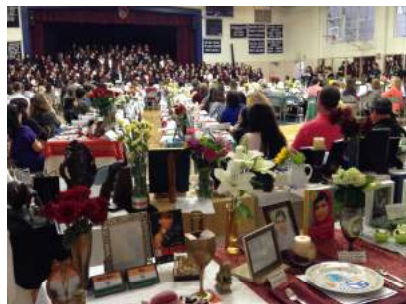
④ Women's Place Project -Dinner Table